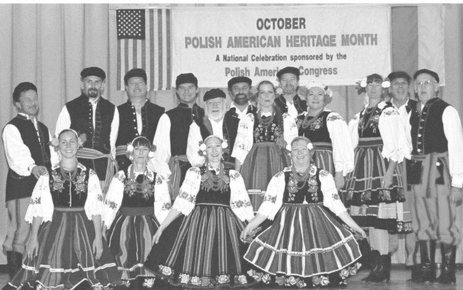
Janosik Polish Folk Dancers at the "Dozynki" Polish Harvest Festival.