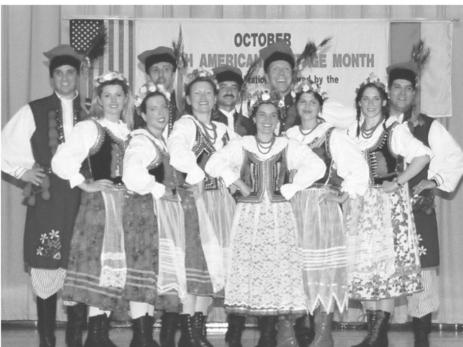
P.K.M. Polish Folk Dancers at the Dozynki.