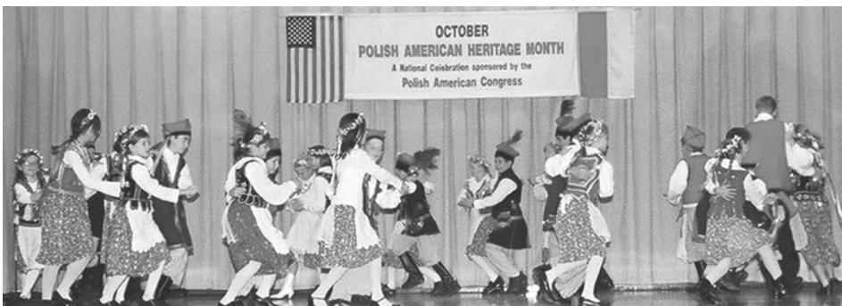
St. Adalbert Polish Language School children performing at the "Dozynki" Polish Harvest Festival.