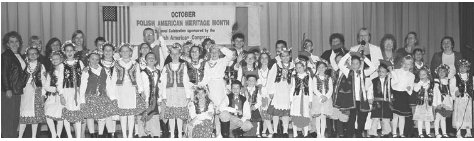
St. Adalbert Polish Language School children and Our Lady of Czestochowa Polish Language School children pose for a group photo.