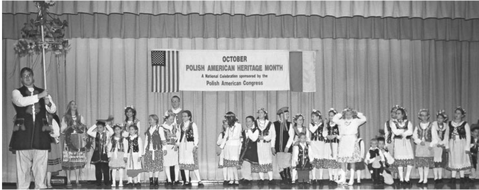
Our Lady of Czestochowa Polish Language School children performing at the "Dozynki" Polish Harvest Festival in St. Adalbert Auditorium.