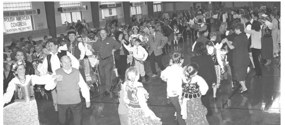
People enjoyed dancing throughout the day at the Dozynki at St. Adalbert.