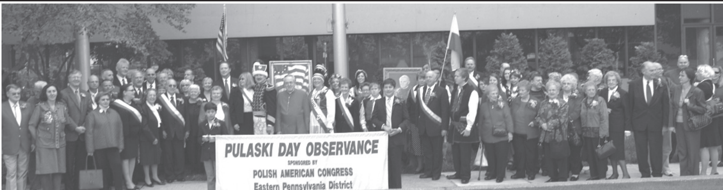
On Sunday, October 5, 2008, the Pulaski Day Tribute Ceremony held at the Kopernik Monument, 18th & Benjamin Franklin Parkway in Philadelphia, PA, honored two great men of Poland, General Casimir Pulaski and Pope John Paul The Great. Cardinal Justin Rigali, Archbishop of Philadelphia, joined with members of the Polish American Congress, Eastern Pennsylvania District, at the Pulaski Tribute Ceremony prior to the Pulaski Day Parade.