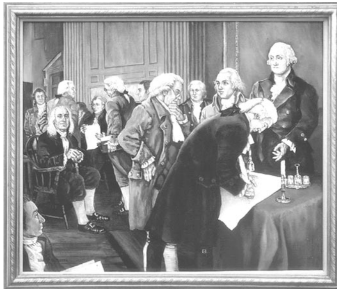
United States Constitution

Two paintings by Walter Cichocki are part of the First Two Democratic Constitutions Display at the Polish American Cultural Center Museum in historic Philadelphia, Pennsylvania