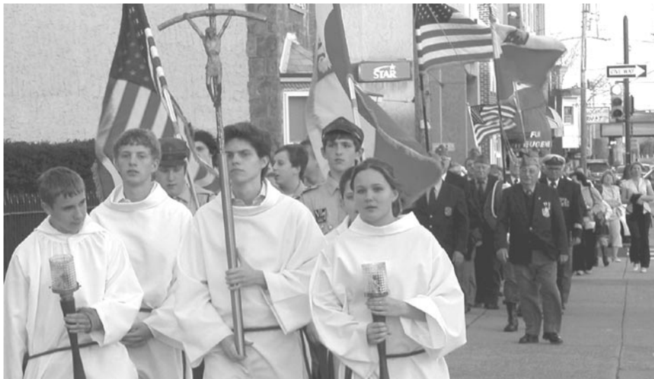
Procession for Pope John Paul II Memorial Mass to St. Adalbert Church, Philadelphia, PA