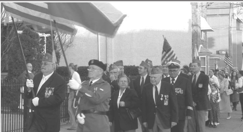
Polish Army Veterans, Post #12