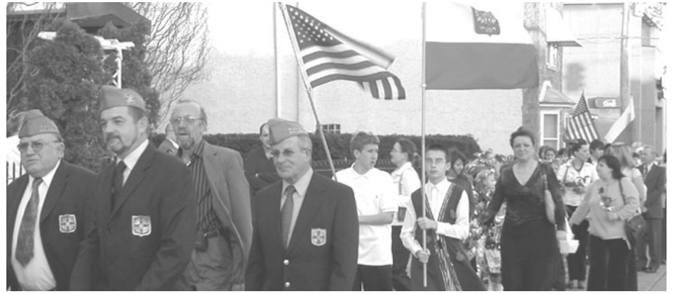
Polish Army Veterans followed by St. Adalbert Polish Language School children