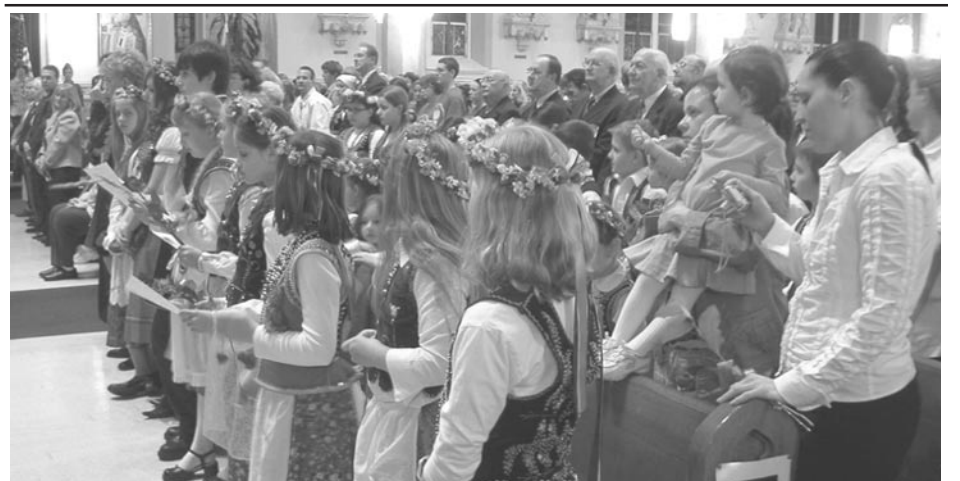
St. Adalbert Polish Language School children singing during the Pope John Paul II Memorial Mass

For more information and additional color photos of this event, visit: www.PolishAmericanCenter.org Pope John Paul Tribute link