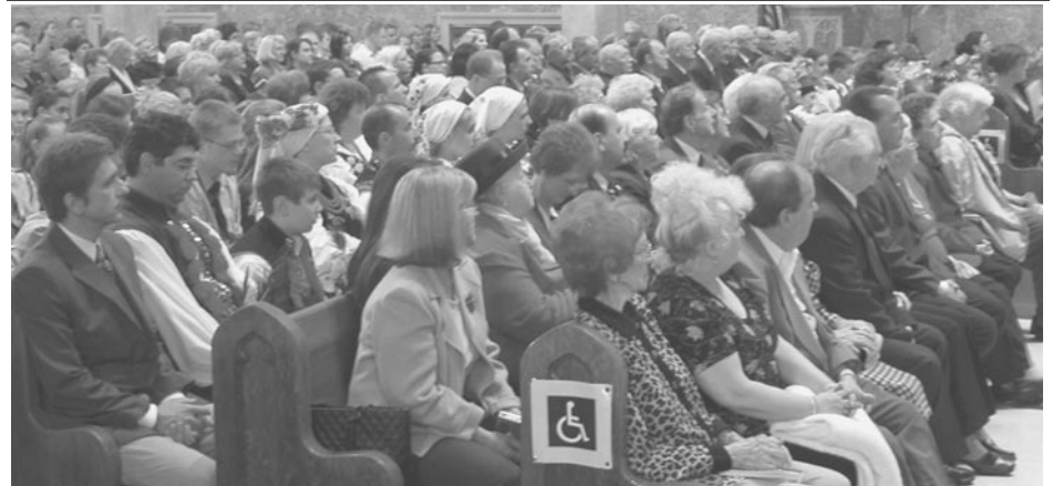
Congregation enjoys tribute during Pope John Paul II Memorial Mass